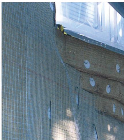
Figure 4 Additional insulation and new plaster façade on original brick building at Kyrkbyn

The property owner is renovating other areas from the 1950s, which were not subject to heritage protection, using solutions that from a maintenance point of view present good technical quality. One solution turns the original brick façade into a plaster façade adding 5 cm of added insulation. The original façade decorations are recreated to some extent (Figure 4). Another solution wraps the building with sheets of metal imitating bricks but with a larger size. The property owner considers one of these two solutions for Torpa.