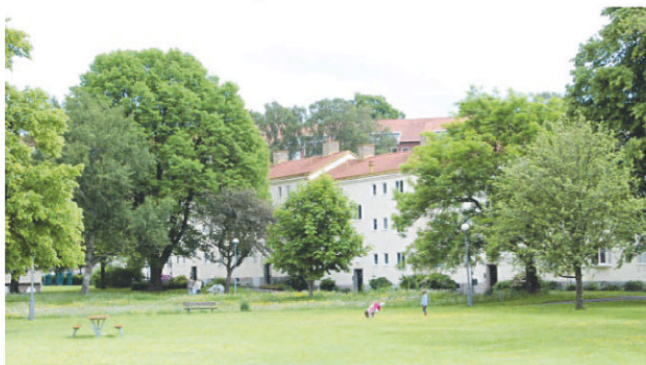
Figure 3 Torpa, the inner green space and surrounding buildings.

Torpa consists of 600 flats of mainly two rooms and kitchen of about 50 sqm organised in 17 blocks around an open green space of almost 3,5 ha. Half of the blocks have brick facades and the other half have plaster facades.