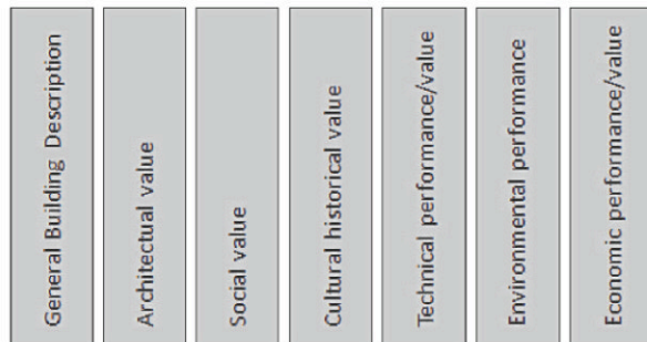
Figure 1 Multi-value model for description of qualities/values in existing housing (elaborated from [3]).

The overall ambition for the transdisciplinary research project was to develop integrated strategies for renovation of early post-war housing to balance environmental, social and economic goals with existing social, cultural and architectural values. For that, a multi-value model was developed to describe different values of existing housing as no such model was found and ready to use (Figure 1) [3].