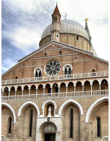
1. Basilica del Santo, copyright: syder.ross / Foter.com

large historic center is home of one of the oldest university in the world, and of several heritage, historic and listed buildings such as the Scrovegni Chapel (with frescos by Giotto), the Basilica di Sant' Antonio